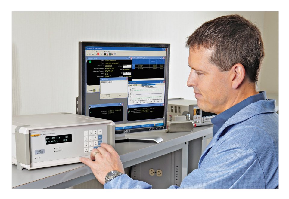
COMPASS for molbox

COMPASS for molbox flow calibration software