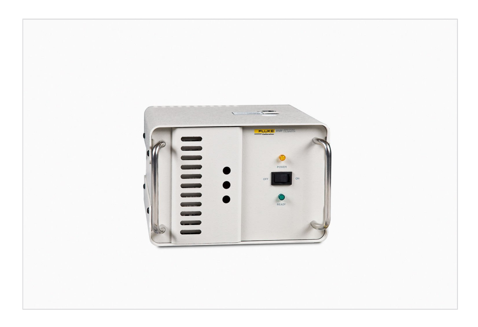
9101 Zero-Point Dry-Well (includes one set of telescoping inserts to provide various smaller diameters)