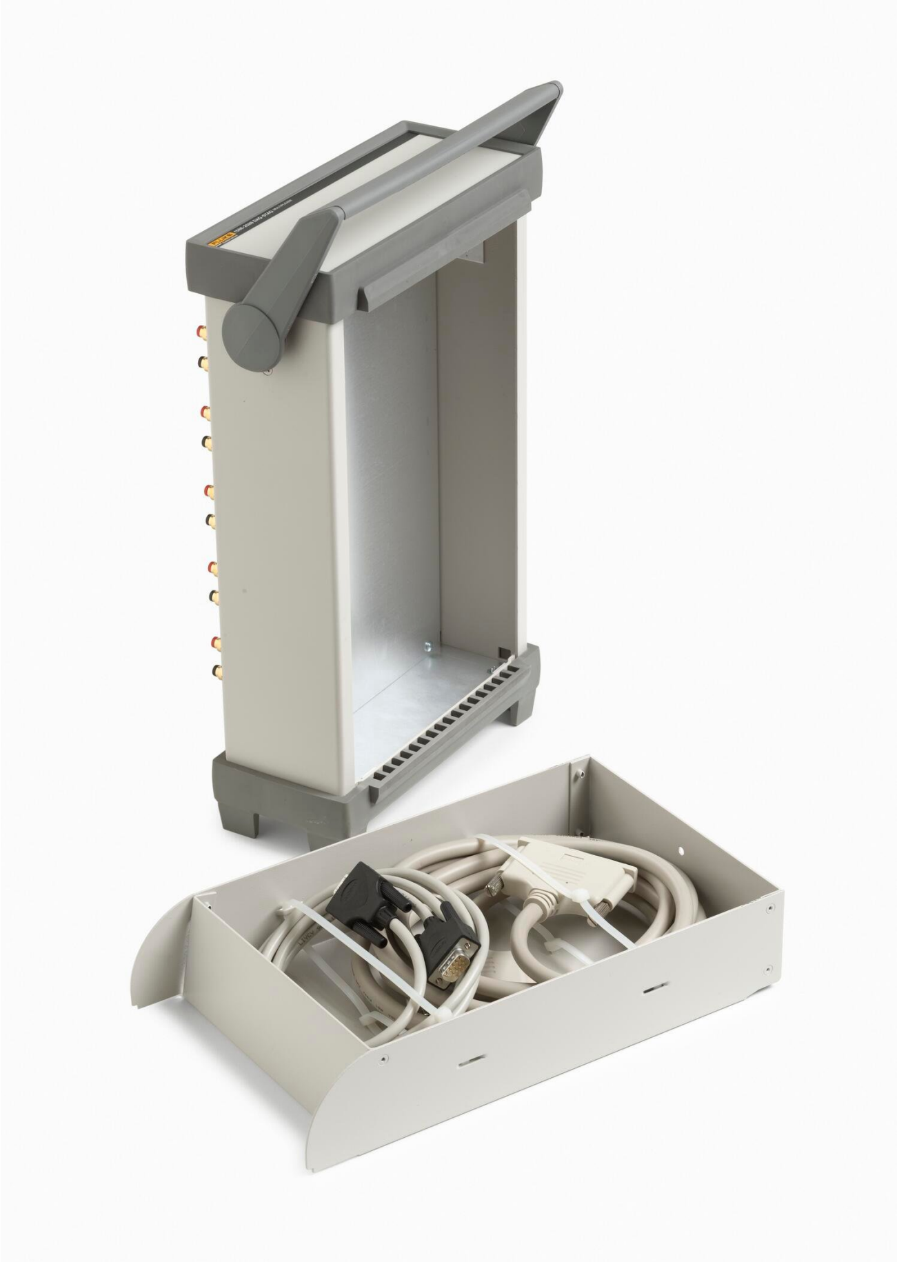
5 Fluke Corporation 1586-2588-KIT | DAQ-STAQ Multiplexer, Adapter Card, Interface Cable