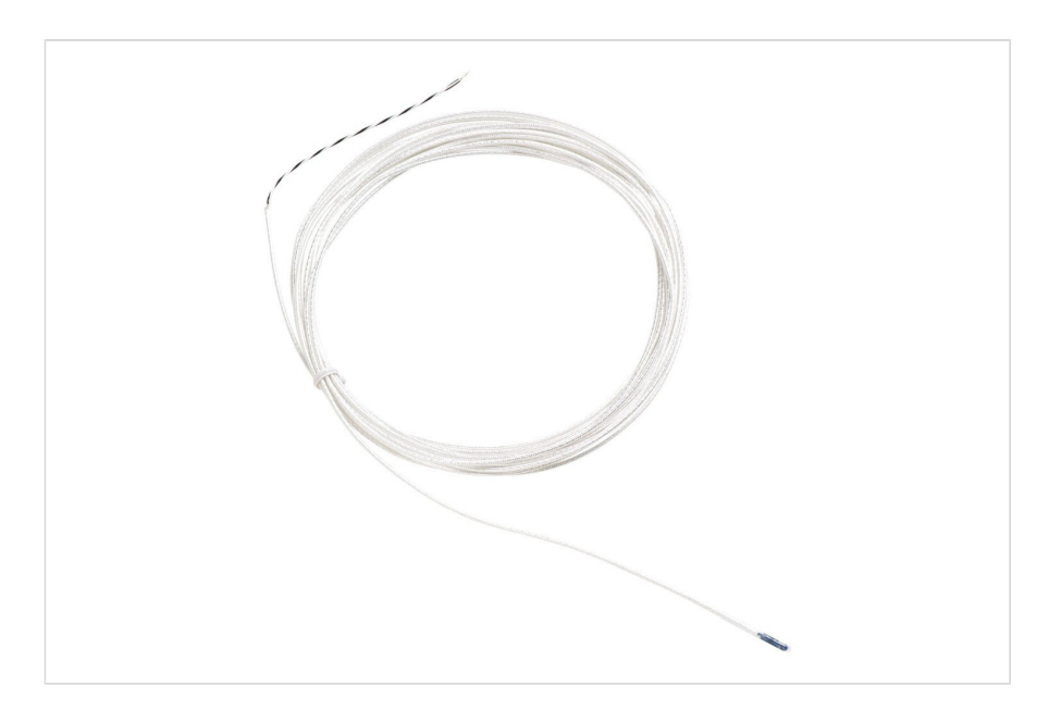
5610, 5611, 5611T, 5665 Temperature Probes, Reference Thermistor Probes