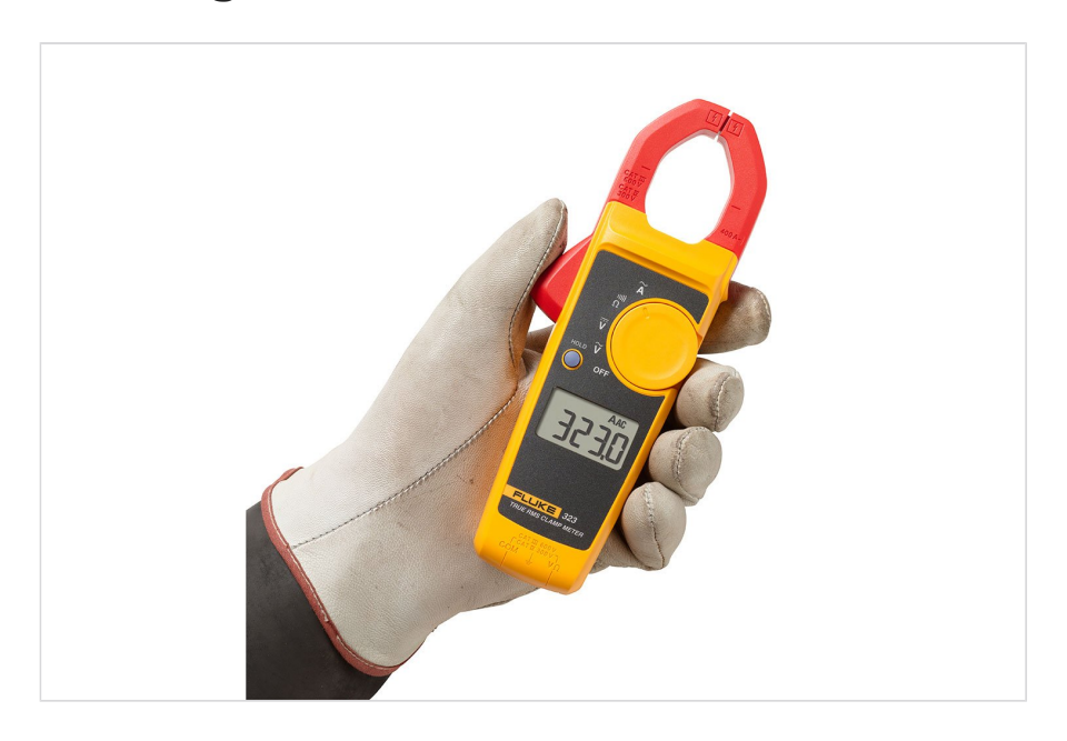
Fluke 323 Fluke 323 True RMS Clamp Meter